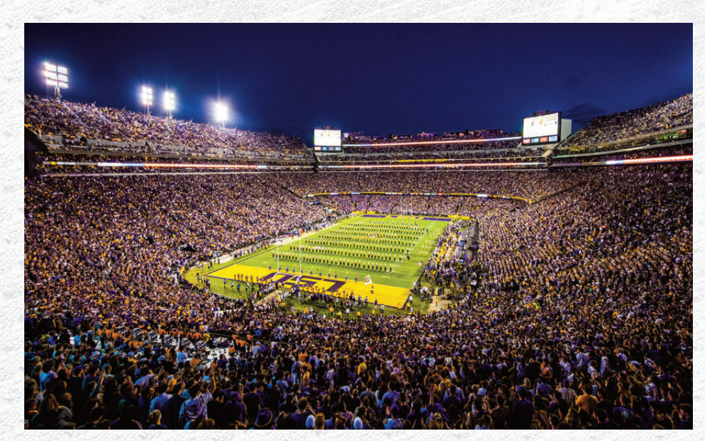
Tiger Stadium routinely features over 100,000 fans on football Saturdays in Baton Rouge.

Our researchers lead the charge to restore our coast, advance new forms of healing, and educate and empower the next generation of leaders, creators, and cultivators. Our drive to innovate is fueled by our desire to create a better louisiana and a better world.