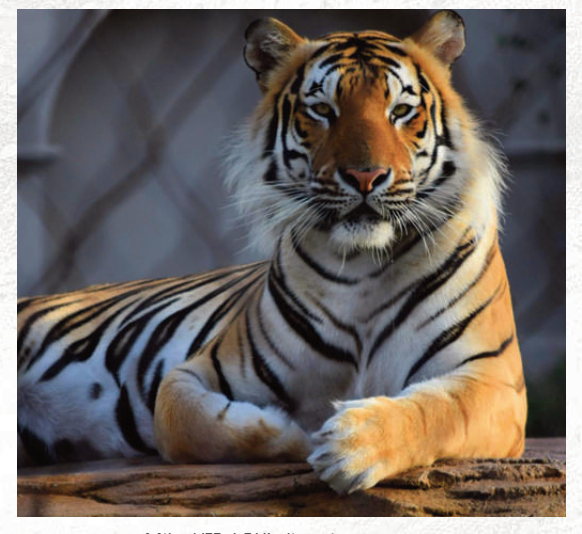
Mike VII, LSU's live tiger mascot

Our scholars collaborate across disciplines and learn from the most acclaimed professors in their fields. Tigers have won Oscars, Emmys, Pulitzers, and Grammys; they have contributed to Nobel Prize-winning research; they have won championships in the NFL, MLB, and NBA; they have been elected leaders of nations; and they have served America as ambassadors.