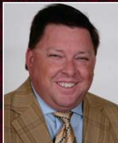
Chuck Walsh Sports Information