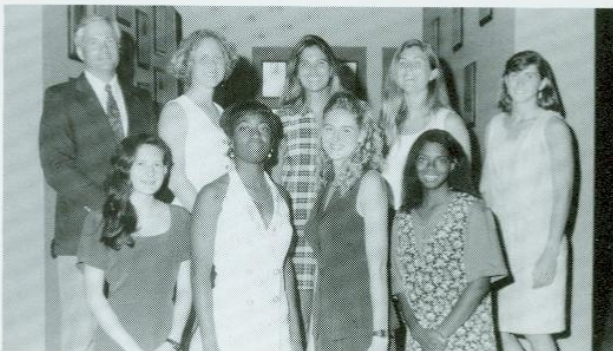
1994 Women's Cross Country Team