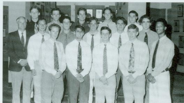
1994 Men's Cross Country Team